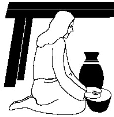
Your faith has saved you...